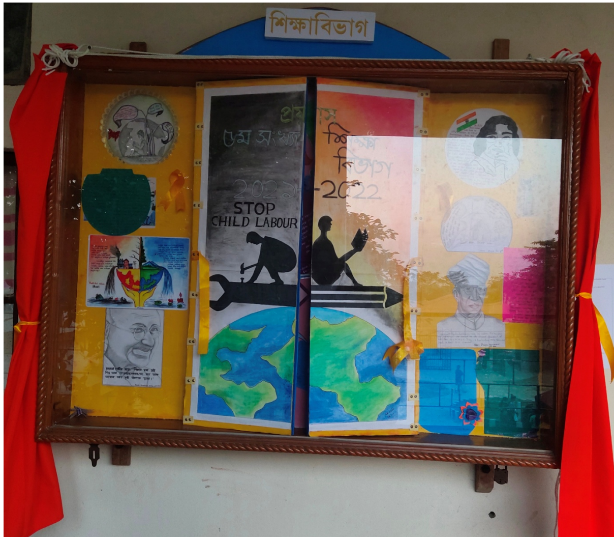
Wall Magazine Department of Education