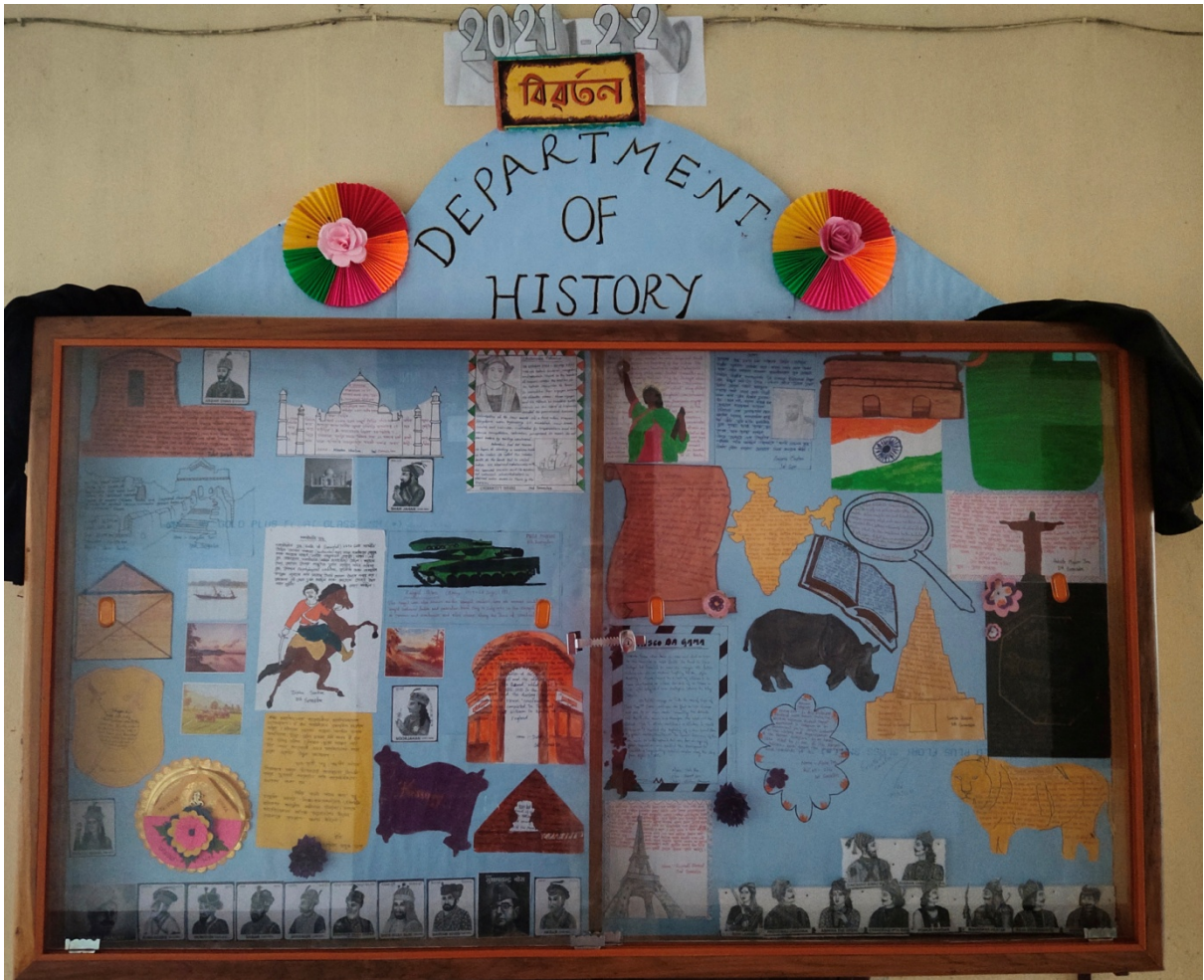
Wall Magazine Department of History