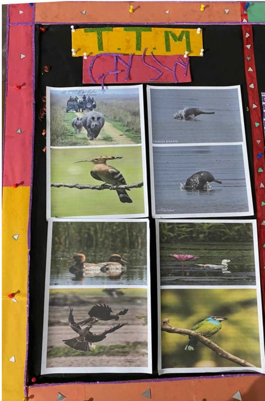
Wall Magazine Department of Tourism and Travel Management