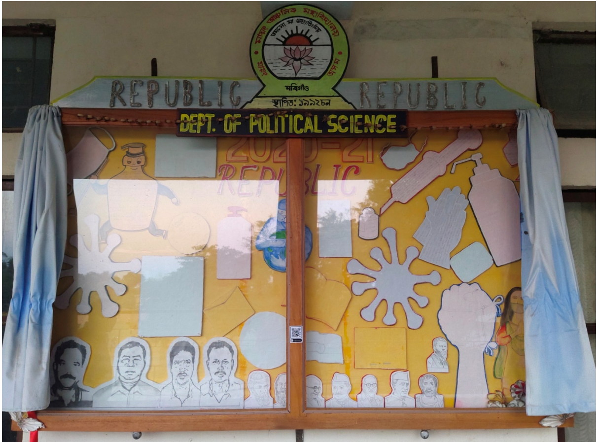
Wall Magazine Department of Political Science