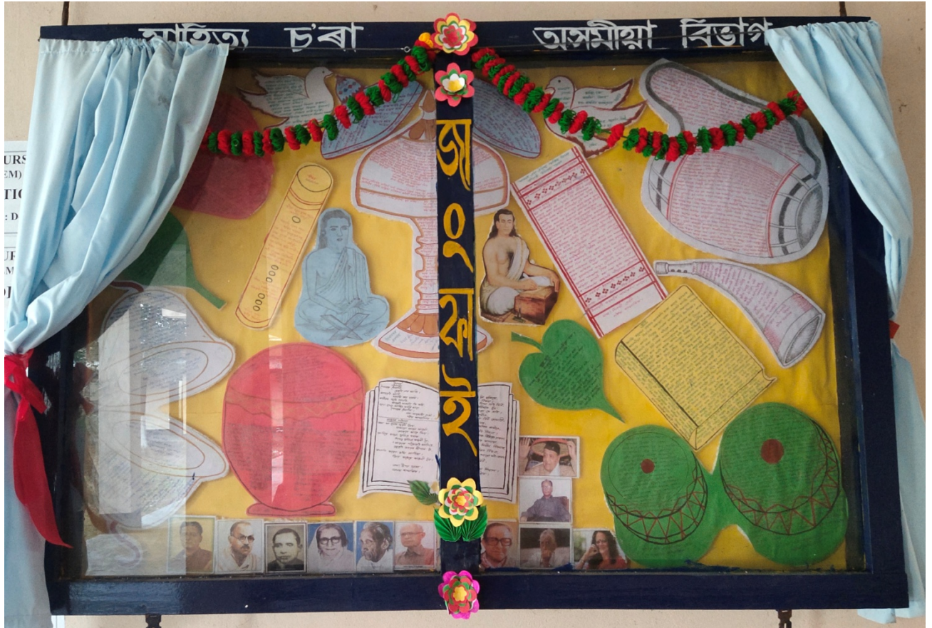
Wall Magazine Department of Assamese