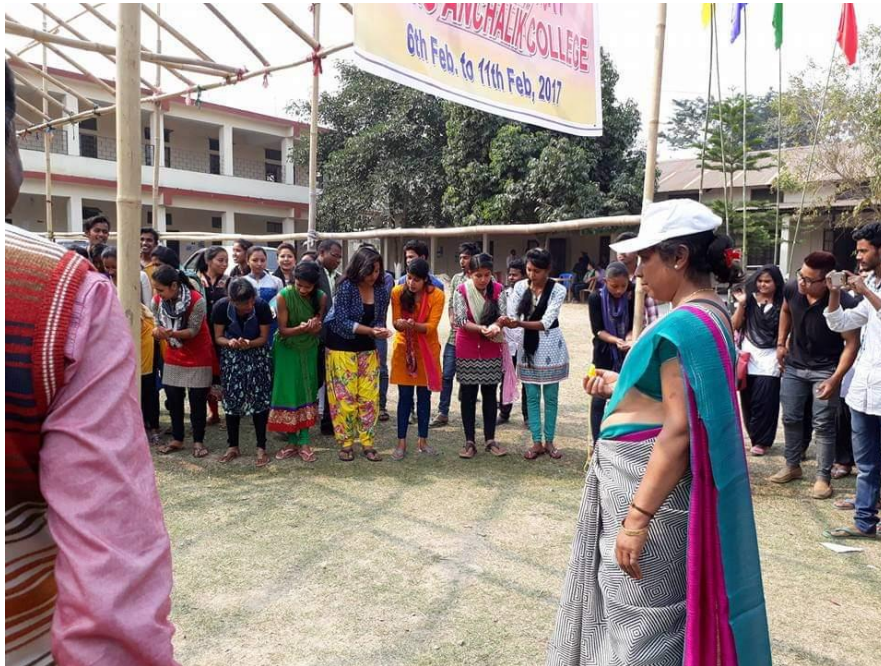
Water Carrying Competition