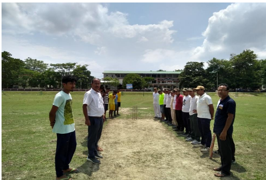
Photo of the Independent Day Cricket Competition