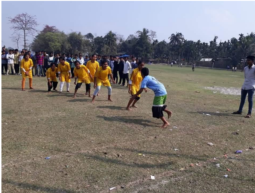
Kabaddi Competition (Boys) Date : 07-02-2017