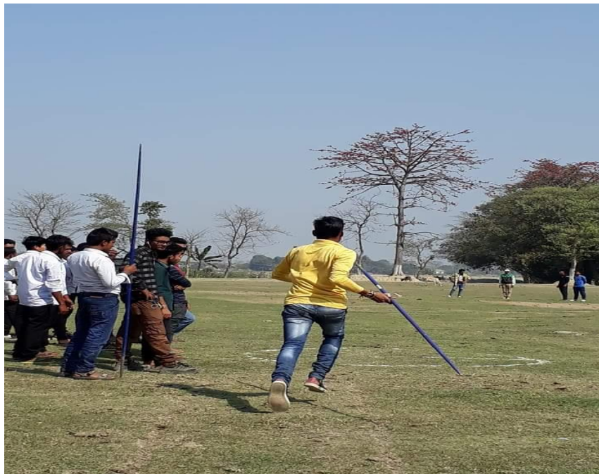
Javelin Throw Competition (Boys) Date : 06-02-2017