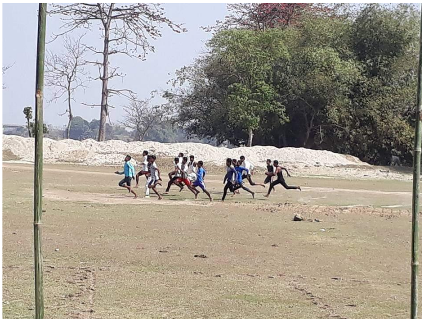
100 Meter Race Competiton (Boys)